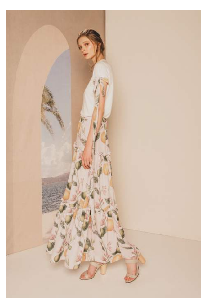
Botanik Resort 20