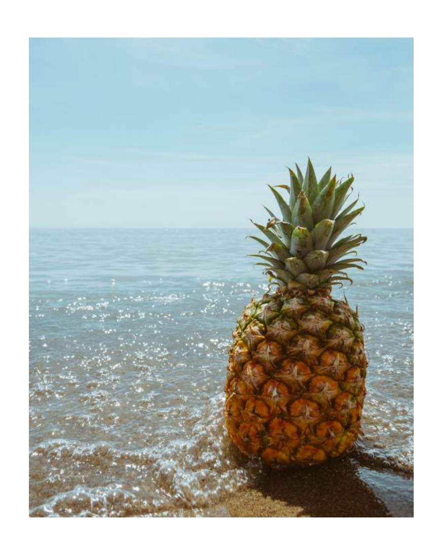
I always bring my own sunshine .