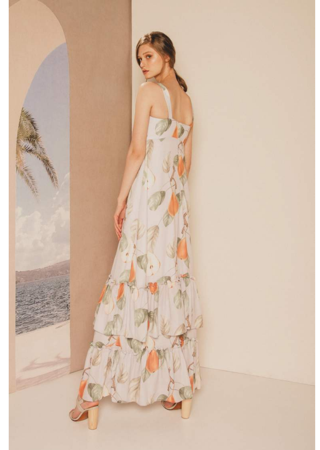
Botanik Resort 20