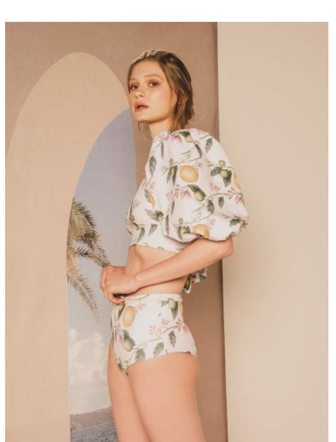
Sotanik Resort 20